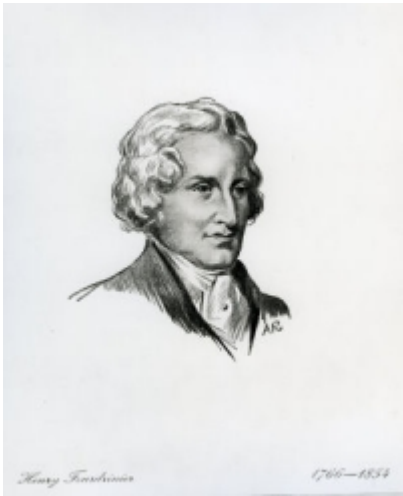
Portrait of Henry Fourdrinier