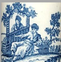
Printing on porcelain 1750-1800